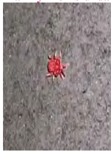
TROMBIDION MUSCAE DOMESTICA