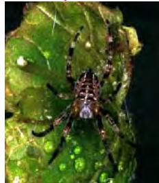
ARANEA IXOBOLA ARANEA SCINENCIA (no picture)