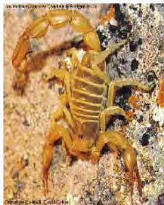
ANDROCTONUS AMOREUXII HEBRAEUS